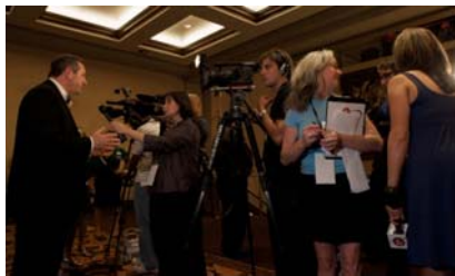
Above: Horseshoe's New Facility