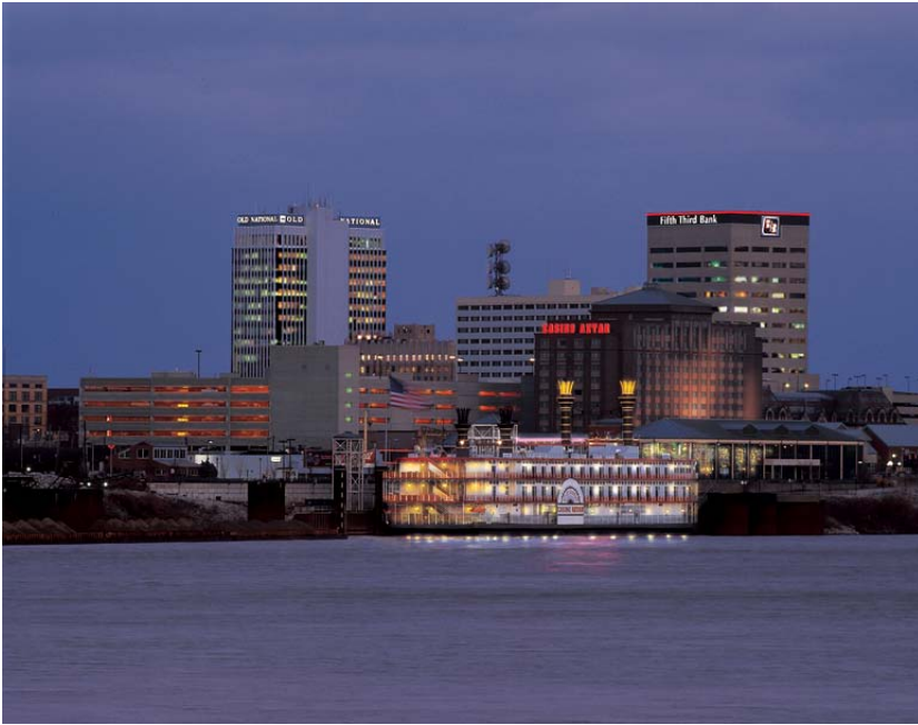
Casino Aztar in Evansville, Ind.