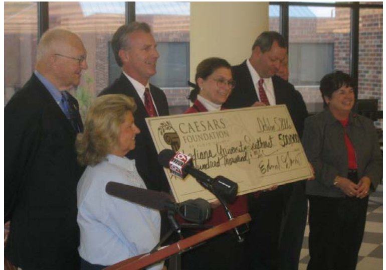
Representatives of Indiana University Southeast receive their $500,000 check from Caesars, the largest donation in their library's short history.