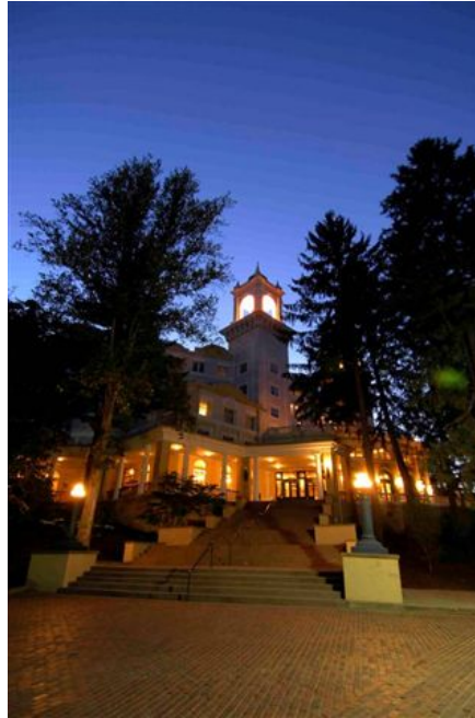
French Lick Casino at night

The casino has given money to local schools, to help pay for student education. It has given to numerous local charities, including a recent, $250,000 event that ended in donation to the Historic Landmarks Foun-