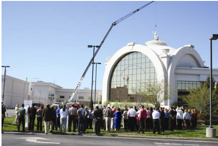
Spectators watch as the visage of Julius Caesar is removed from the crown of Caesars Indiana - the first step in re-branding the casino.

Beginning this summer, what is now known as Caesars Indiana will be called Horse- shoe Southern Indiana, joining Horseshoe Hammond in the Harrah's family.