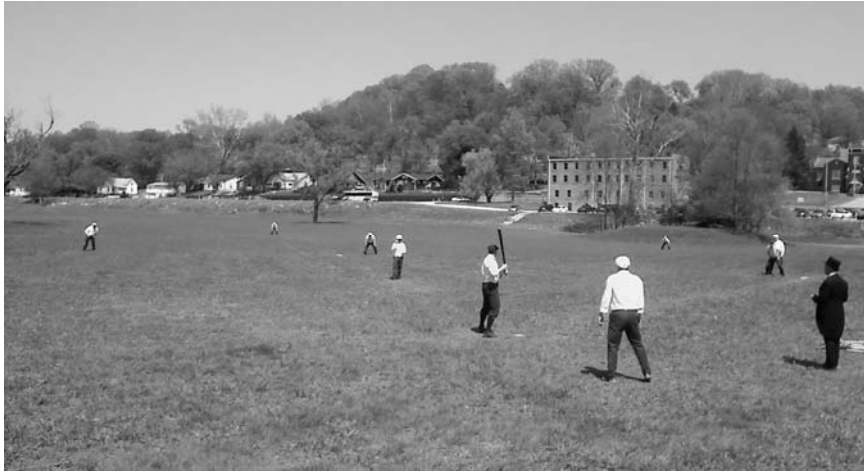
Teams took part in a vintage game near French Lick Resort Casino on April 26.