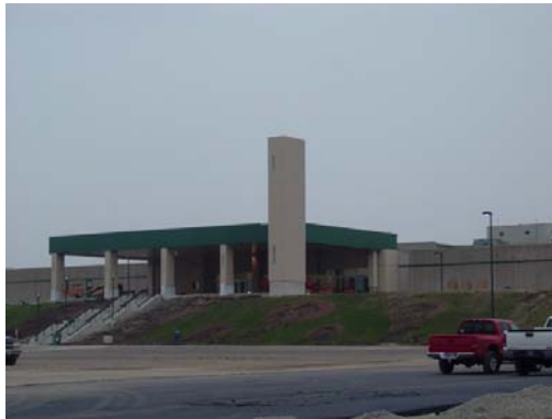
Renovations and construction continue at Hoosier Park Racing & Casino in Anderson. At right, an outside view of what will be the casino property.