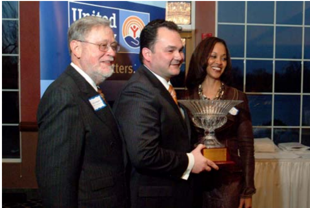
In a March 25 ceremony, Resorts East Chicago was named Casino of the Year by the Lake Area United Way. The recognition came in response to Resorts' owner Ameristar's $130,268 in contributions to this year's United Way campaign.