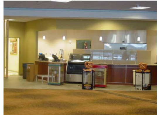
The Italian Deli at Hoosier Park Racing & Casino