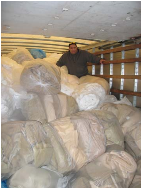
Resorts East Chicago hosted a "Laundry Day of Service" in late March, donating extra sheets, towels and blankets from the hotel to nine area homeless shelters. The shelters will offer the extra supplies to those it serves.