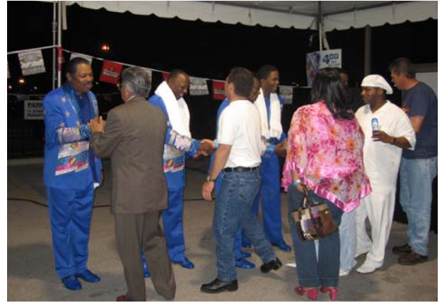
Members of The Spinners meet with their fans at one of their two Resorts East Chicago shows last month.

The events brought more than 2,000 guests to the outdoor tent.