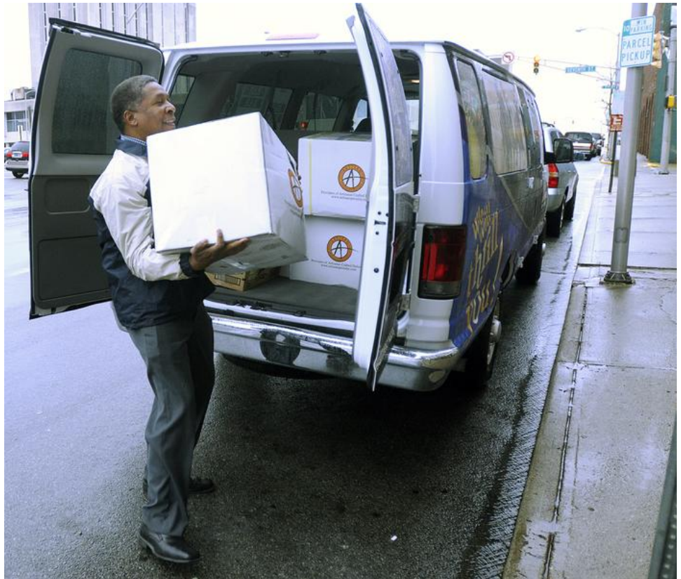
A Hoosier Park employee unloads Thanksgiving supplies for The Christian Center. The casino doubled its donations over previous years.

"As a member of the community, Hoosier Park understands the importance of giving back, especially in the holiday season," said Hoosier Park