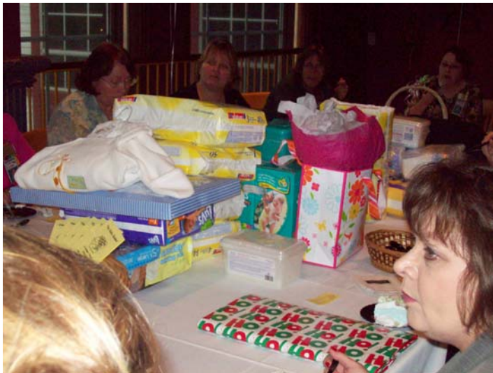
Attendees at the Argosy Community Action Team's shower for the Baby Basket gather around the pile of gifts, which will benefit parents in need during the holidays.

Horseshoe's annual employee United Way campaign also is under way.